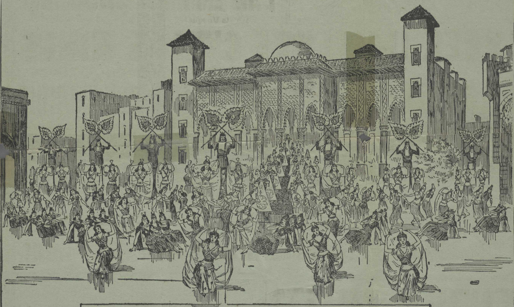
SUPERB BALLET OF 300 BEAUTIES BEFORE THE MOORISH KING.

Depicting, with historic truth and accuracy, the Trials, Struggles and Achievements of the Inspired and Most Noble Discoverer, who gave a New World to the Old.