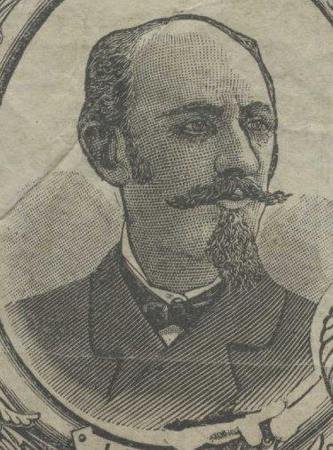
J. A. BAILEY

P. T. BARNUM'S GREATEST SHOW ON EARTH & THE GREAT LONDON CIRCUS.