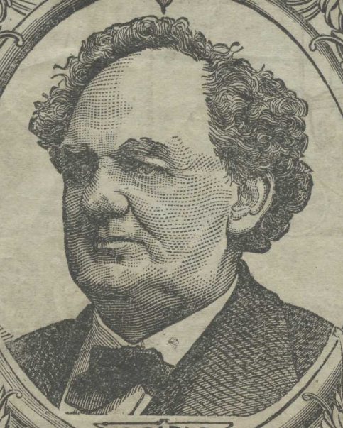
P. T. BARNUM