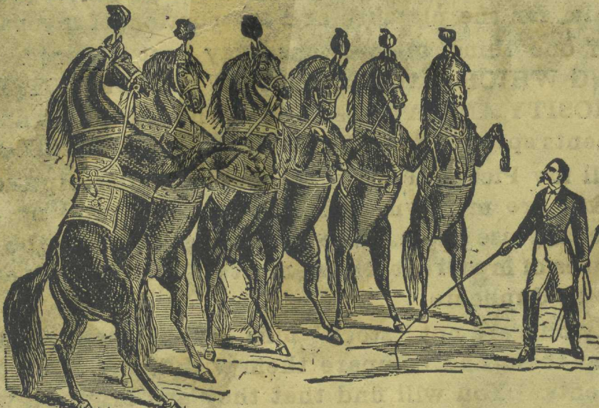
To which have been added Seven New Trick Horses from Europe.