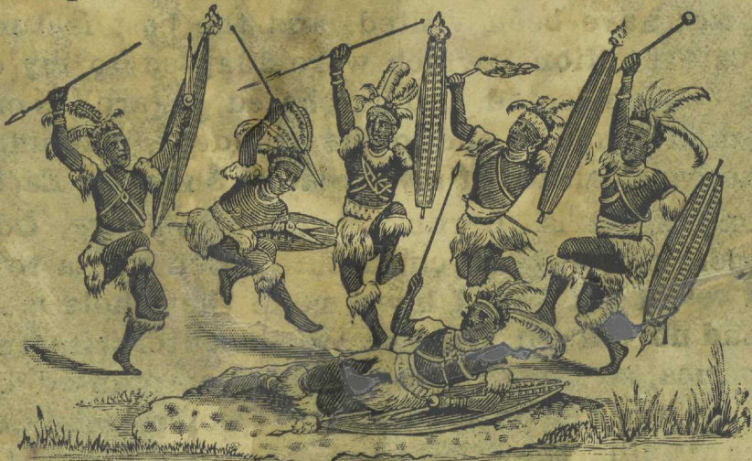
IN THEIR INTERESTING PERFORMANCES.