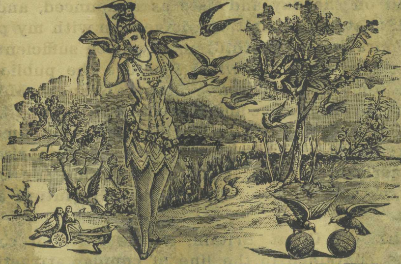
WITH HER FLOCK OF TRAINED DOVES.