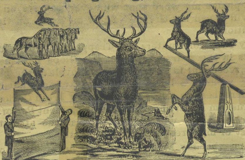
IN HIS WONDERFUL ACTS AND LEAPS.