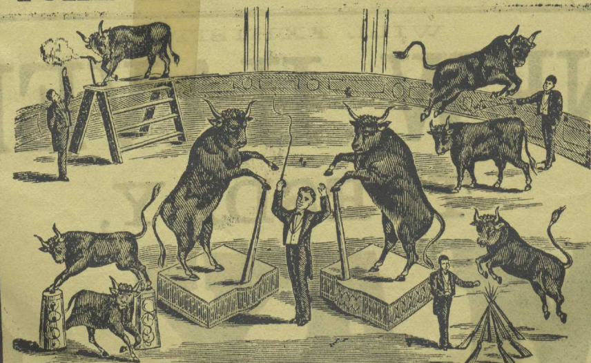
IN THEIR REMARKABLE PERFORMANCES.